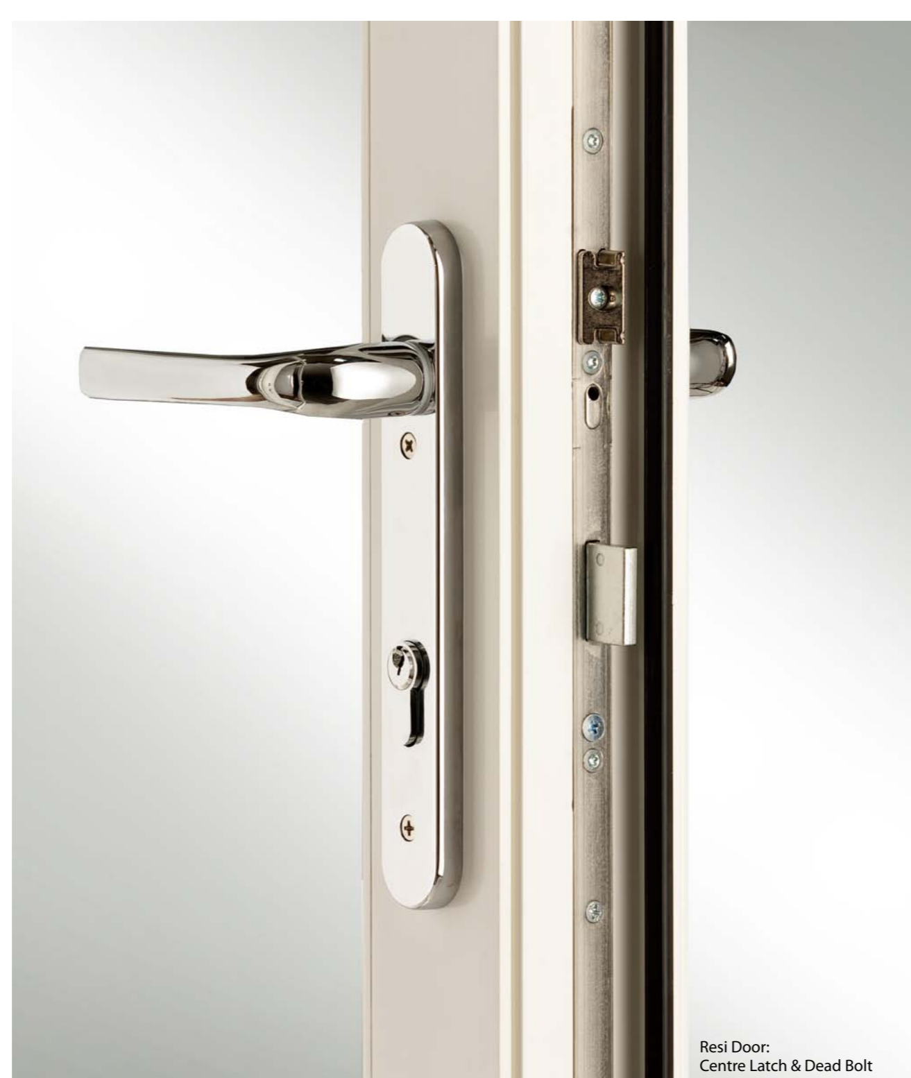
Resi Door: Centre Latch & Dead Bolt